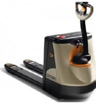
Motorized Pallet Jack