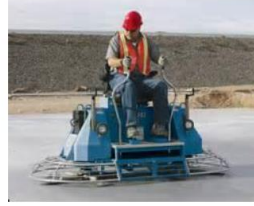
Ride On Concrete Trowel